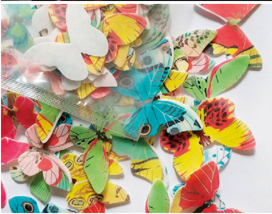
Fresh flowers and butterflies made from rice paper cause no harm to the environment.