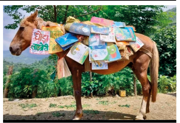
Burdened by knowledge, as it were.

Iibrary on four legs has been established in the Kumaon. Horses are made to trudge from village to village carrying books which are lent out. Let's hope BWC is successful in convincing them to use mechanical carts in place of animals just like thirty years back we created awareness about the "unique" Pet Libraries which had sprouted up in a few cities and were enthusiastically but unthinkingly supported by animal lovers. They took pride in loaning live creatures like dogs, rabbits, guinea pigs, tortoise, fish, snakes and birds (parrots and mynas), all given swanky names. It was dealt