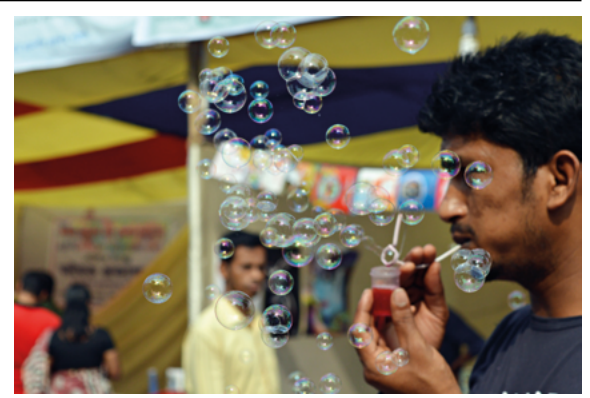
Bubbles look good but contribute to air pollution.

using faux butterflies made from rice paper. Guests open folded napkins containing these paper butterflies and they "flutter" out! Butterfly motifs are usually a part of Bengali weddings.