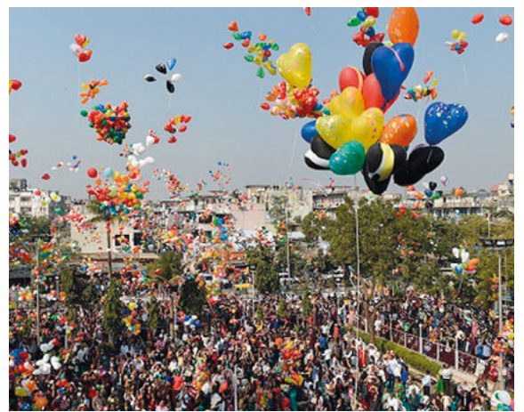
Colourful plastic balloons look beautiful but are deadly for innocent creatures.

Shockingly, butterflies can be ordered online abroad. The spectacular Monarch is largely used by companies for butterfly releases, as well as the Painted Lady. They are delivered