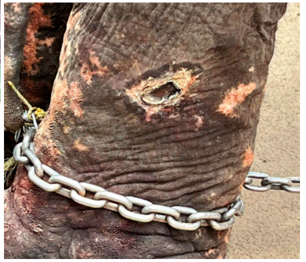
All pictures are taken during Thrissur Pooram. The ankush-it has a sharp spike fitted to a wooden handle-is a banned iron goad. But it is used extensively in all festival parades in Kerala with the tacit support of the state government.

Elephant Director directed all Chief Wildlife Wardens to ensure that the post mortem of every deceased elephant must be conducted by a team of 3 veterinarians, in the presence of 3 wildlife enthusiasts having good work records, the only state which has failed to implement it is Kerala. Meanwhile, during the first 9 months of 2023 the total number of captive elephants increased by 22.