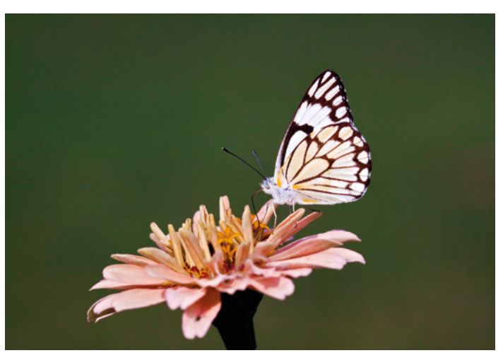
Pretty and delicate butterflies released suffer and die.

Butterfly ornaments, paper weights, pen stands and key chains may look pretty, but not upon knowing that they represent capture, torture and death. Another method is 24kt