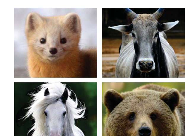
Please visit www.bwcindia.org to know about our aims, activities and achievements.

We request you not to use natural paint brushes which are made of stiff bristle or soft hair of animals such as mongoose, pig and squirrel because they are tortured and killed.