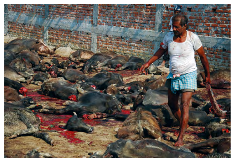
Killing unlimited in 2009.

Soon after the new Government of India was formed, Beauty Without Cruelty requested a few politicians to bring up the forthcoming Gadhimai mass animal sacrifice with the Nepal Government. We also asked for plans to be made to stop the movement of animals across the porous border.