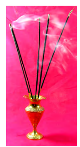
Are the agarbattis you use vea?