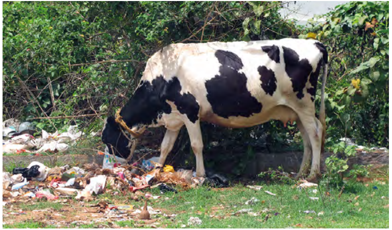
Cow foraging garbage with plastic bags.

Why? Animals like cows, dogs, cats, birds and even wildlife have died due to having inadvertently eaten plastic.