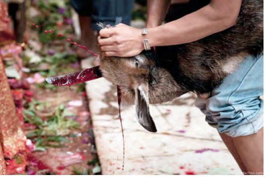
Beheading is murder.

Why? However carefully a kite is flown, the manja can unwittingly severely wound, maim and kill birds – and humans.