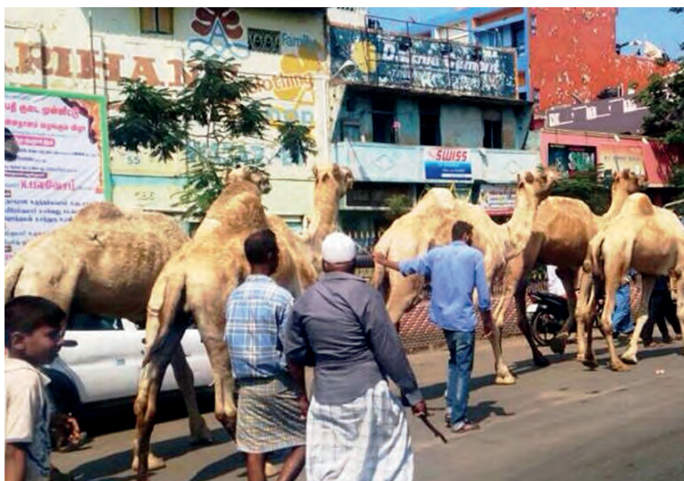
Camels are made to walk thousands of kilometres, controlled by the nose ring, made to stay in unused places filled with debris and butchered in public places all in the name of sacrifice.

Camels are being smuggled in large numbers for slaughter on Bakri Id, to the states of Kerala, Tamil Nadu, Andhra Pradesh and Karnataka and even to Bangladesh via Bihar. They are bought in weekly markets and the Pushkar Mela – taken by road mostly on foot or crammed into trucks with tied legs, traveling thousands of miles. Nose rings are pierced and pulled to control