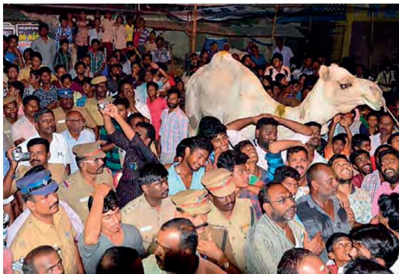
News and photo courtesy: dt Next (14 September 2016)

O n Bakri Id, a camel was brought for sacrifice by a film director of Nelpettai. On receiving the information, Vilakuthoon police rushed to the spot and held talks with the film director. A large number of people gathered and police posted security in the area. In view of the ban ordered by the Hon'ble Court on camel sacrifice, the police promptly acted. They told the director and producer that they would be arrested if they facilitate the sacrifice.