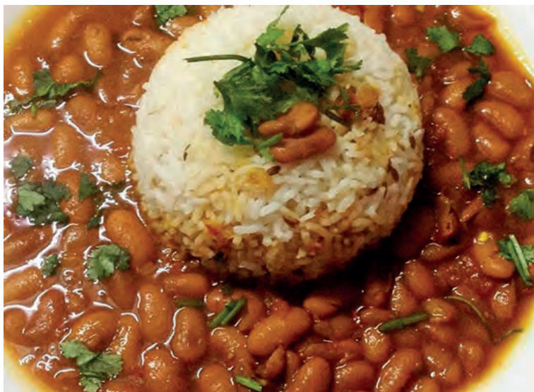
Rajma chawal.

Rajma chawal is one of the best complete protein dishes says Nirmal Nischit.