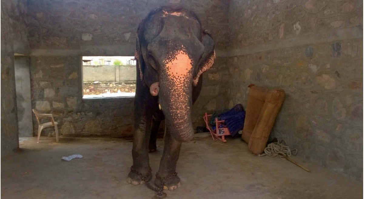
Amber Fort elephant in Jaipur Hathigaon (April 2016) tied for 18 hours in an isolated concrete cell after giving joyrides to tourists. Most suffer from depression and severe foot conditions.

An overview of the Supreme Court Petition on Captive Elephants is presented by Suparna Baksi Ganguly