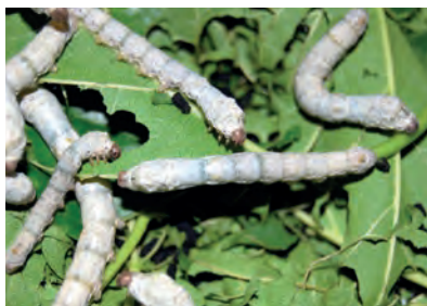
Silkworms ( Bombyx Mori ).

Let us turn to history. It is said that silk was discovered