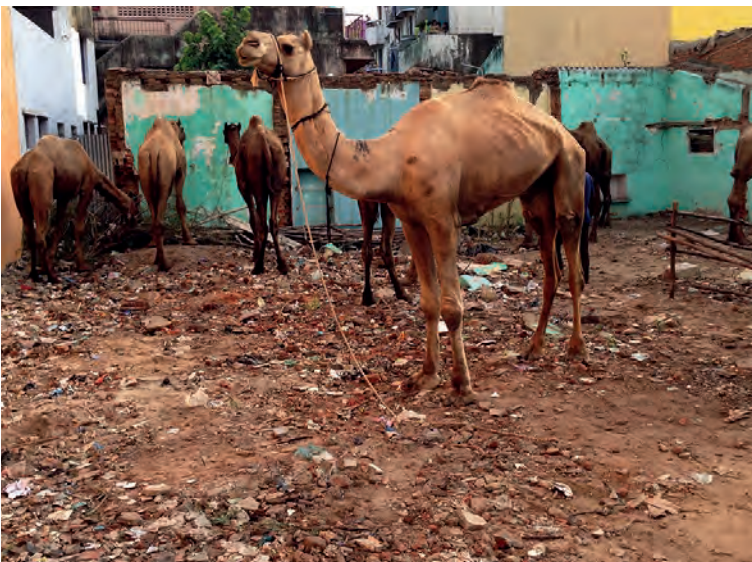
You can see the ribs of these camels after exhaustion from the journey. They will be beefed up just to be killed.

After due process of time and several adjournments, the Hon'ble Court passed the landmark order on 28 August 2016 banning slaughter of camels in Tamil Nadu and