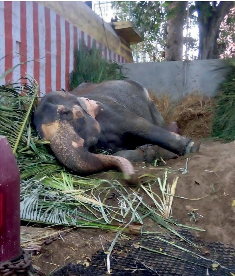
This elephant, maintained by a religious institution, died of foot rot and multi-organ failure.

Every year several incidents come to light, in which captive elephants have turned violent and injured or killed human