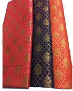
Cotton fabric with silk zari.

Simultaneously, pure silk yarns of 13/15 and 20/22 denier are twisted, gummed (a gelatinous substance called sericin is removed) and dyed red or yellow. This silk yarn is the core of pure zari.