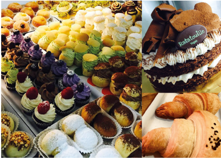
Some pastries at Ratatouille.

In Turin, it is common to see locals drinking a quick shot of coffee, an espresso, and eating a pastry on the go, as a short break during the day. That's what we needed at this