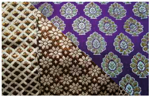
Poly Lurex Brocade Fabrics.

For plastic zari instead of silver or copper, plastic badla is utilised. Small thin plastic strips are superimposed in gold or other colours. This zari is sold mainly under the brand name of Lurex which is a yarn or thread having a metallic appearance. It is used mainly for knitting and weaving. Plastic zari or art jari is the cheapest and usually made of alternatives to silk like polyester fibre coated with aluminium.