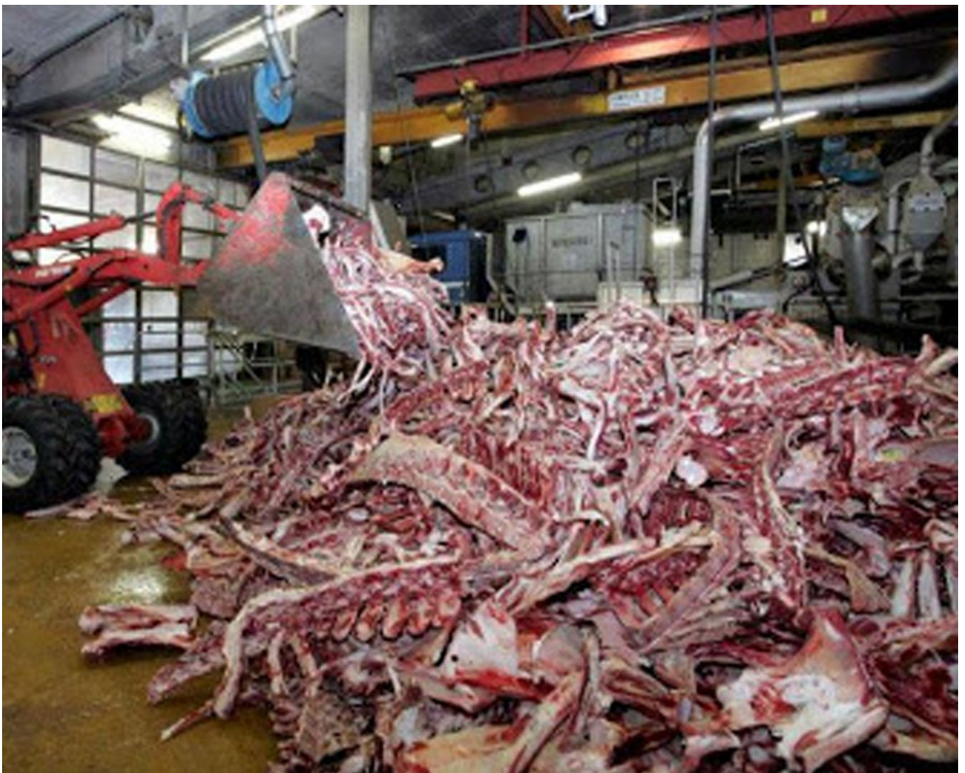
Fresh animal bones at a gelatine factory.

Presentation on 28 August 2017 at New Delhi for the Chairman and Members of the Expert Committee for Replacement of Gelatine Capsules with Cellulose Capsules vide Ministry of Health & Family Welfare Order by Beauty Without Cruelty (the NGO that has since 1974 been guiding people to make lifestyle changes to benefit themselves and animals)