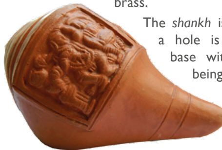
Bishnupur terracotta shankh.

Horns made of wood and bronze are also available. Descendants of the horn are the bugle and trumpet, made of brass.