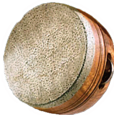
The drumhead of the Kanjira is made of lizard skin.

Whenever there has been drought in Maharashtra it has adversely affected the makers of sitars and tanpuras (plucked string instruments used for classical Hindustani music) in Miraj of Sangli district. Gourds or pumpkins form the base of the resonating