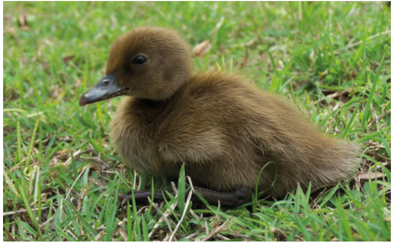
The Khaki Campbell is encouraged as an egg laying breed.

Although ducks are often eaten in Kerala, West Bengal, Assam and Kashmir they are not as popular as chicken. Typical Anglo-Indian and Kerala cuisines include duck roasts, and in Kerala duck eggs are common. Peking roast duck, traditionally carved on the table, is found on the menus of Chinese restaurants.