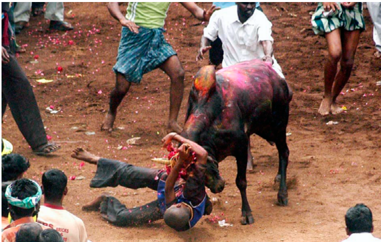
Jallikattu is barbaric, not brave. At Pongal, bulls with sharpened horns were goaded to fury and let loose on crowds for men to chase and grab their horns resulting in injuries and death to bulls and humans.

The Supreme Court Bench of Justices K S Radhakrishnan and Pinaki Chandra Ghose stated “Jallikattu, Bullock-cart Race and such events per se violate Sections 3, 11(I)(a) and 11(I)(m)(ii) of the PCA Act and hence we uphold the notification dated 11.7.2011 issued by the Central Government, consequently, Bulls cannot be used as performing animals, either for the Jallikattu events or Bullock-cart Races in the State of Tamil Nadu, Maharashtra or elsewhere in the country”. One of the 12 declarations and directions that followed was “Parliament, it is expected, will elevate rights of animals to that of constitutional rights, as done by many countries around the world, so as to protect their dignity and honour”.