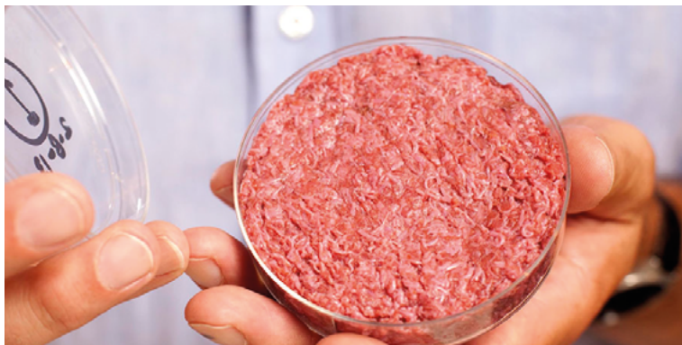
Cultured meat begins as flesh taken from a living or slaughtered animal and grown in a laboratory.

The discovery and development of imitation, artificial, faux or mock meat has been going on for long. Worldwide lab-grown meat is often promoted on grounds of health, environment and ethics, but we must beware of the “ethics” claim because not all meat substitutes are of non-animal origin.