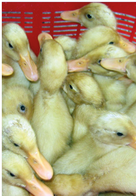
For sale.

Duck feathers are used in making utility, decorative and adornment items. The citation in every Nobel diploma is calligraphically done using a goose feather.