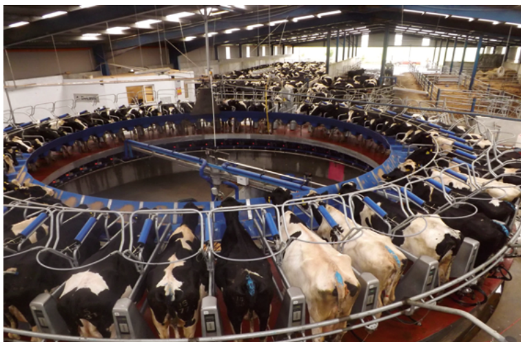
Cattle, milked dry.