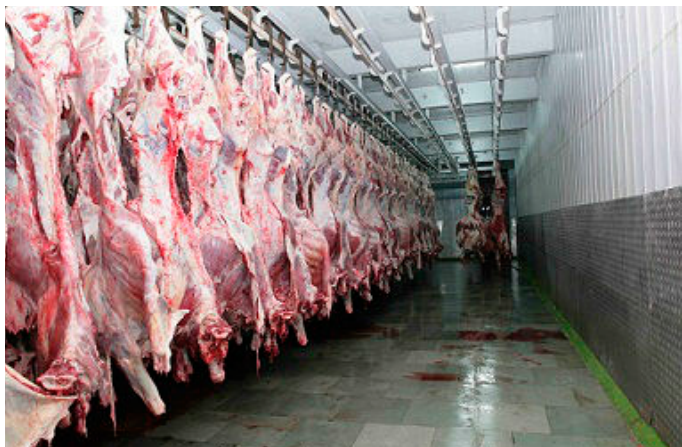
Cattle, killed for meat.

The White Revolution resulted in the Pink Revolution (meat) because milch cattle became machines and many such beings (living creatures) were turned in to things (commodities). The dairy industry's policy is "use animals for milk and then kill them for meat". Thus milk has turned in to liquid meat, and thanks to the dairy culture, we have lost our Indian culture.