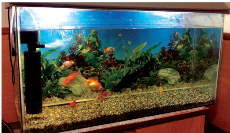
When moved to an unfamiliar environment, fish experience stress. Fish can also have panic attacks, either because it is scared with the light coming through the thick aquarium glass or because of other bully fish around and finding nowhere to hide or go, it can either die of seizures or jump out of the tank and die on the floor, gasping for air.

Placing fish immediately in a new and unprepared aquarium is a common cause of fish death, as well as their too sudden transfer to water that is too different from that of their previous place of abode. Osmotic shock is a trauma caused by too rapid variation of the mineral content in the water. This is a common cause of death in newly purchased fish, 2-6 days after being brutally immersed in aquariums by inexperienced or careless owners.