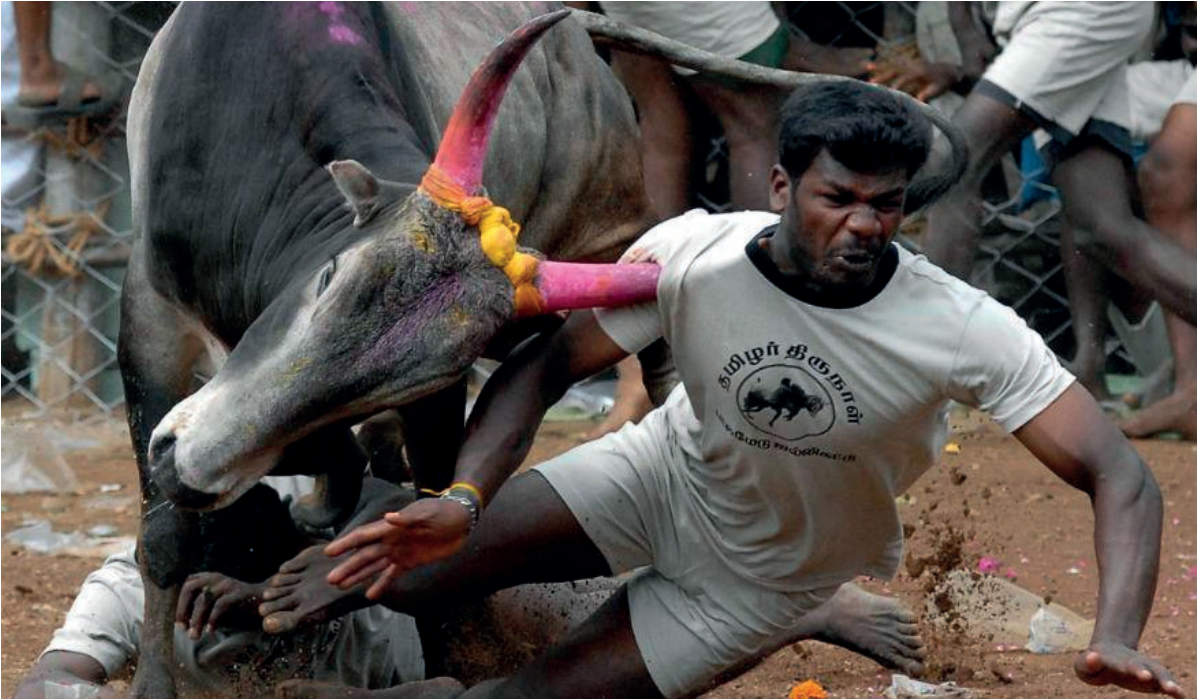
Villagers pinned down and injured by a bull in Madurai.

We as animal activists failed the bulls by sitting complacent for 3 years and not counteracting on social media the fast-growing youth movement in support of Jallikattu being projected as a part of Tamil culture and identity.