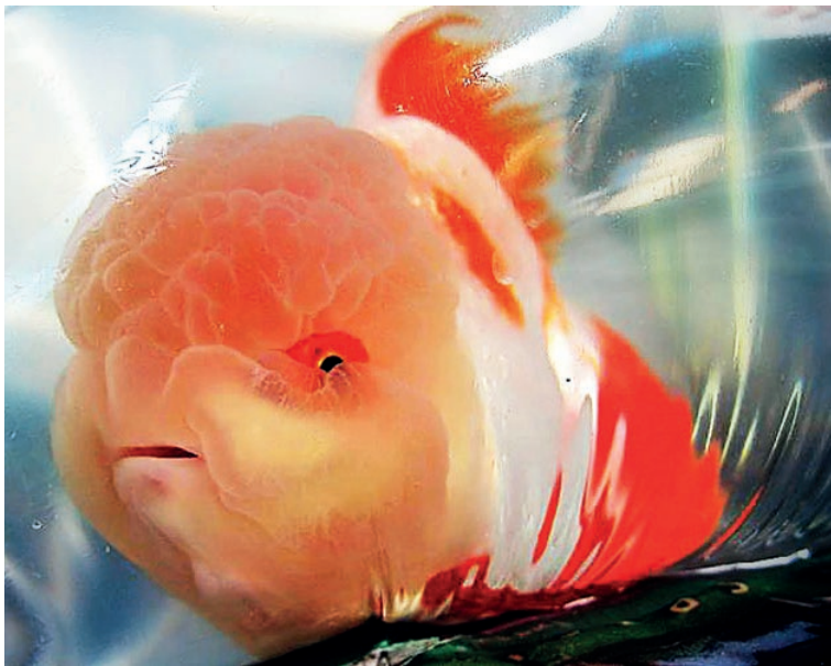
Fish sold in plastic bag.

About 90% of the freshwater fish sold in stores are raised on fish farms. Goldfish, for example, are usually bred in