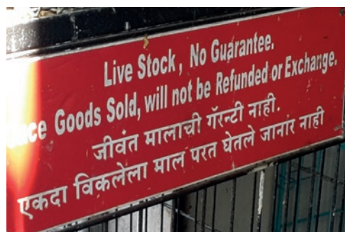
Often the unscrupulous pet shop owner has interest in keeping the fish alive (by feeding antibiotics) only till it is sold. 7 out of 10 fish die within the first week of purchase.

Only a humane person would feel for any living being that is kept in a confined area for life. Most children by nature are sensitive and feel for animals but they learn to be insensitive by collective responses around them as a norm. Unfortunately, fish are considered good 'starter pets' for children at the cost of fish.