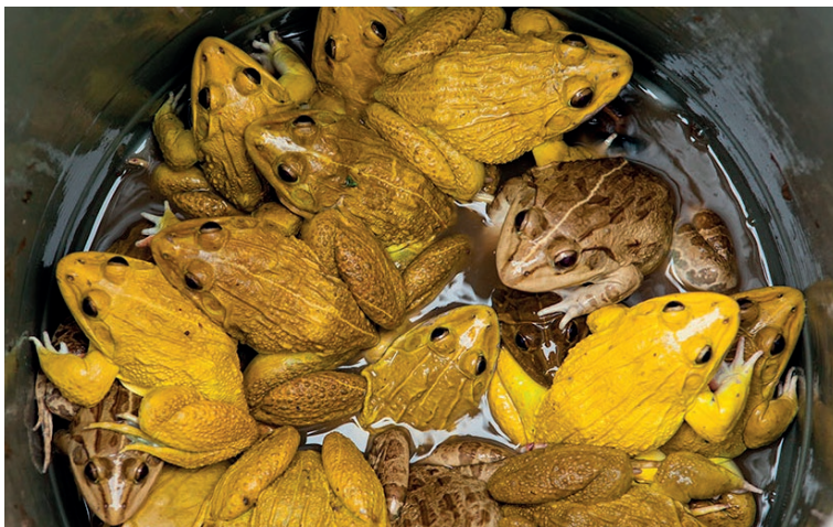
Poached Indian bullfrogs: the trend of hunting them has reached appalling proportions in Goa.

India was internationally respected for imposing this ban. The manner in which the frogs were brutally butchered had been extensively covered and condemned by the foreign